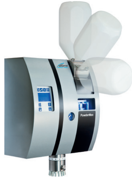
Clean filling system

also provides improved working hygiene – nothing is spilt to get into the air ways. Eltosch Grafix refill bottles of high-quality powders are available in 750g and 1500g bottles.